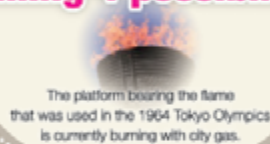
The platform bearing the flame that was used in the 1964 Tokyo Olympics is currently burning with city gas.

3 New ecosystem that can Reduce environmental impact